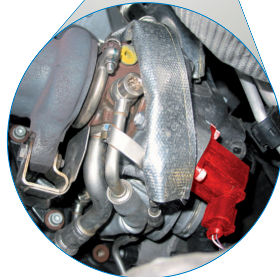
Bypass valve in VW EOS TFSI (highlighted in red)